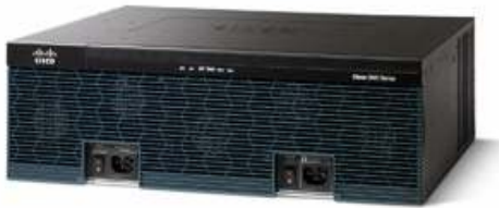
Figure 2. Cisco VG 224 Analog Phone Gateway